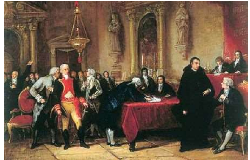
Declaring Independence in Venezuela