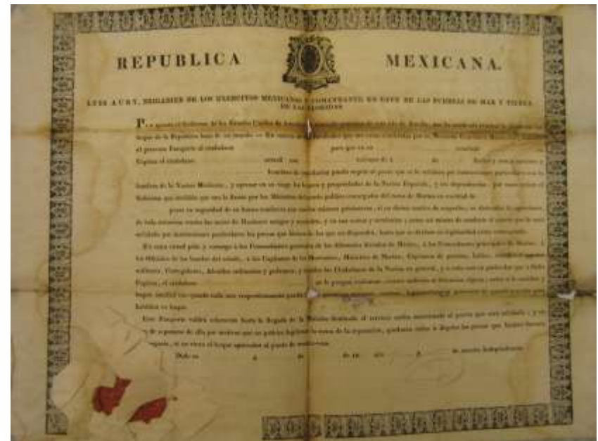
Gefe de las fuerzas de mar y tierra de las Floridas